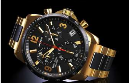
100 Pairs- Branded Watch