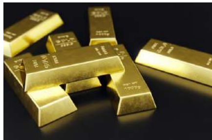
10000 Pairs - 25GM gold