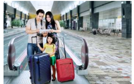
5000 Pairs - Family tour