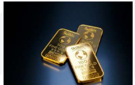
25000 Pairs — 50GM gold