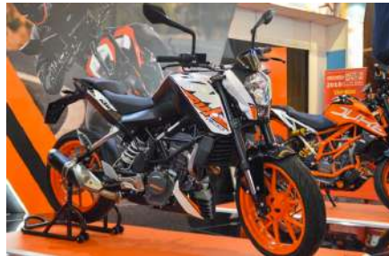
3000 Pairs - Bike fund