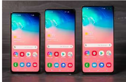
500 Pairs - 4g mobile