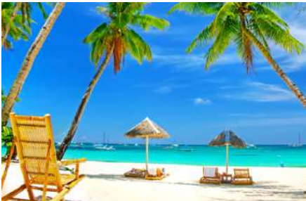
1500 Pairs - Goa trip or 3GM gold