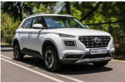
7000 Pairs - Car fund