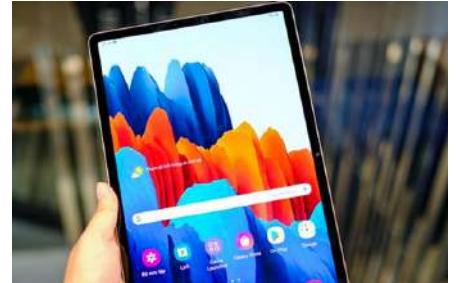
1000 Pairs - Tab