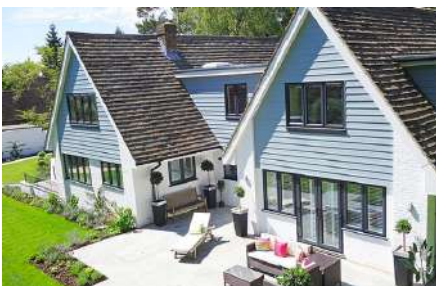
50000 Pairs — Home fund